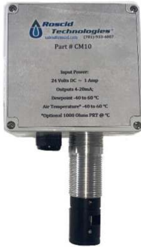
Wall Mount Configuration